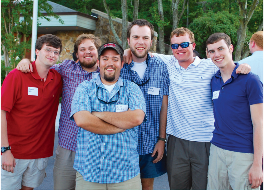
UGA CED summer interns working in Dalton.

Dalton and the Dalton Downtown Development Authority (DDDA). As a result of these recommendations, the DDDA adopted a new slogan "Meet Me Downtown." The DDDA reported increased interest in downtown properties by potential business owners, increased utilization of the Freight Depot as an event site, the creation of a marketing brochure for the new downtown walking trails and an enhanced town/gown relationship between Dalton State College students and downtown Dalton merchants.