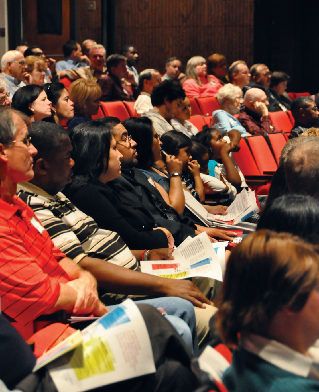
Community members attend the visioning roll-out event in 2010.