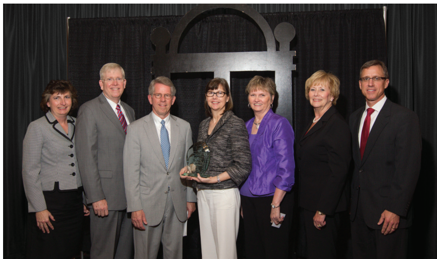
Community members accepting the “Four for the Future” Award.